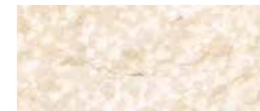
Rough Bush Hammered