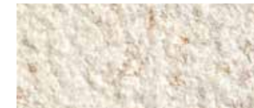
Rough Bush Hammered