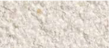
Rough Bush Hammered