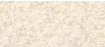
Rough Bush Hammered